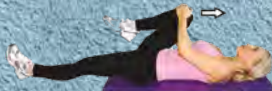
6. Single Leg Back Stretch ▶