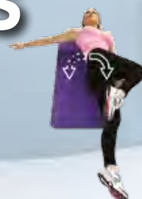
3. Supine Lumbar Twist Stretch ▶