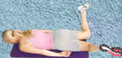
8. Internal Rotation Lying Double Leg ▶