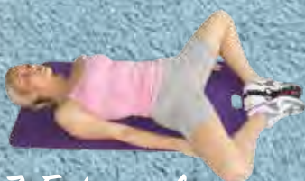
7. External Rotation Lying Bilateral ▶