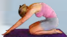
1. Shell Stretch ▶